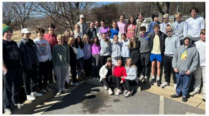
2024 Youth Ski Trip