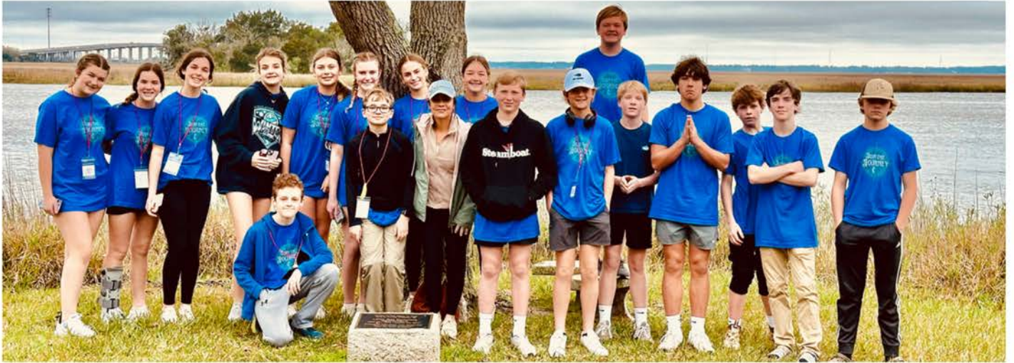
Central's 2024 Confirmation Retreat at Epworth by the Sea