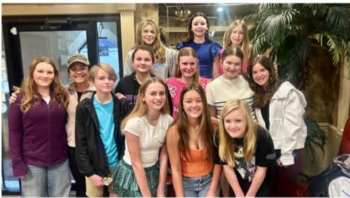
Jr. High Breakfast Outing